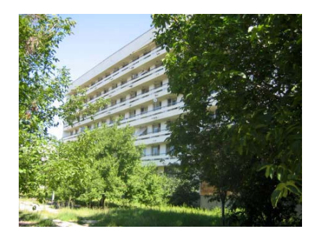
Figure 1. Elderly people home "St. Vassilij Veliki" – general view

The main objectives of the project are to reduce the costs for heat energy, while meeting the DHW needs of 200 old people, living in the house "St. Vassilij Veliki". Through the construction of a big solar thermal installation free energy is obtained from the sun (instead of expensive imported liquid fuels), while at the same time the harmful emissions of carbon dioxide (CO_2) are reduced. A third objective is achieved – a positive attitude towards RES of a wider group from the population. The fourth project objective was to examine the performance of a big solar thermal installation from a technical and economical point of view, while operating jointly with a DHW installation, on the base of liquid fuel boilers. The fifth project objective was achieved through large project dissemination for a wider utilization of solar thermal installations in the existing social housing.